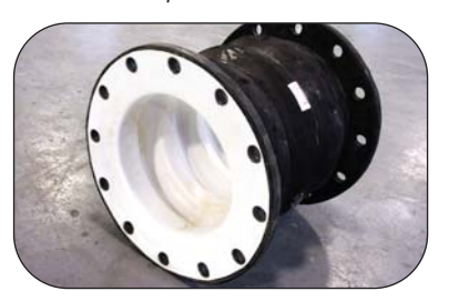
Rubber PTFE Lined Expansion Joint