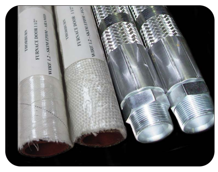
Conductive & Non-Conductive Furnace Door Hose Assemblies

Thorburn offers unmatched capabilities and expertise in applications, Engineering, Design and Manufacturing of leading end flexible piping and ducting systems. Targeting Thorburn's resources allows its core technology to be leveraged into hundreds of demanding applications.